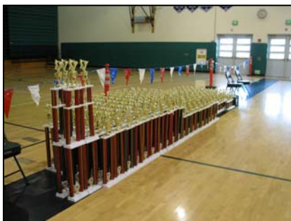
Competitors took home beautiful 1st thru 3rd place trophies.